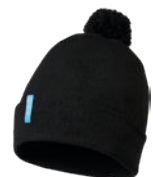
OLIVINE NEW 37531