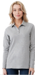
OAKVILLE 38086 / 38087