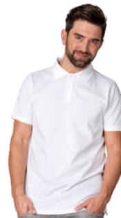
GRAPHITE 37508 / 37509