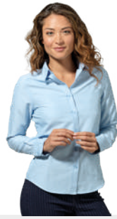
POLLUX 38178 / 38179