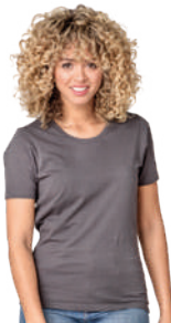
AZURITE 37506 / 37507