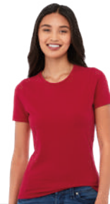
BALFOUR 38024 / 38025