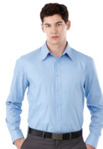
HAMELL 38168 / 38169