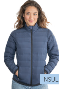
FAIRVIEW 39420 / 39421