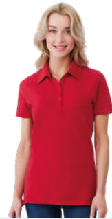
MARKHAM 38084 / 38085