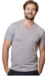
SOMOTO 38030 / 38031