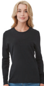
PONOKA 38018 / 38019