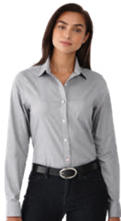
VAILLANT 38162 / 38163