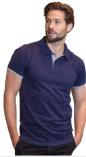
MORGAN 38110 / 38111