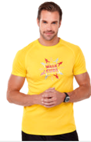
NIAGARA 39010 / 39011