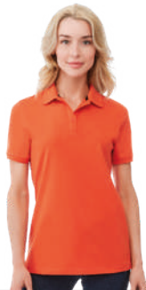
CALGARY 38080 / 38081