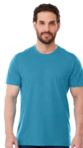
JADE 37500 / 37501