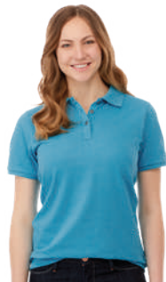
BERYL 37502 / 37503