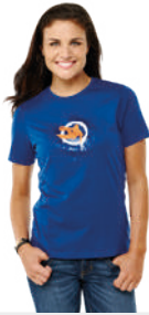
NANAIMO 38011 / 38012