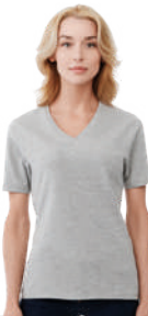
KAWARTHA 38016 / 38017