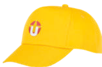
FENIKS KIDS 38667