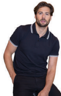
AMARAGO 38108 / 38109