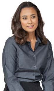
CUPRITE NEW 37524 / 37525