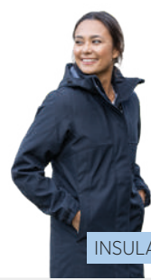
KEEFE NEW 38331